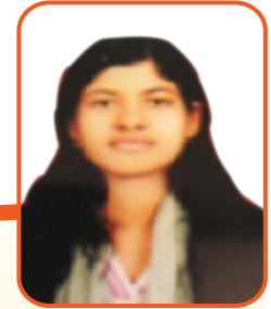
LAXMI PROGRAMME – PGDAC

I am from Allahabad and did BA Psychology. Due to less marks in BA Psychology, I could not get admission in MA Psychology in regular college. I was keen to do MA in Psychology, therefore registered with IGNOU. I did MA in Clinical Psychology and secured 1st class. Presently, I am working as Psychologist with a reputed NGO.